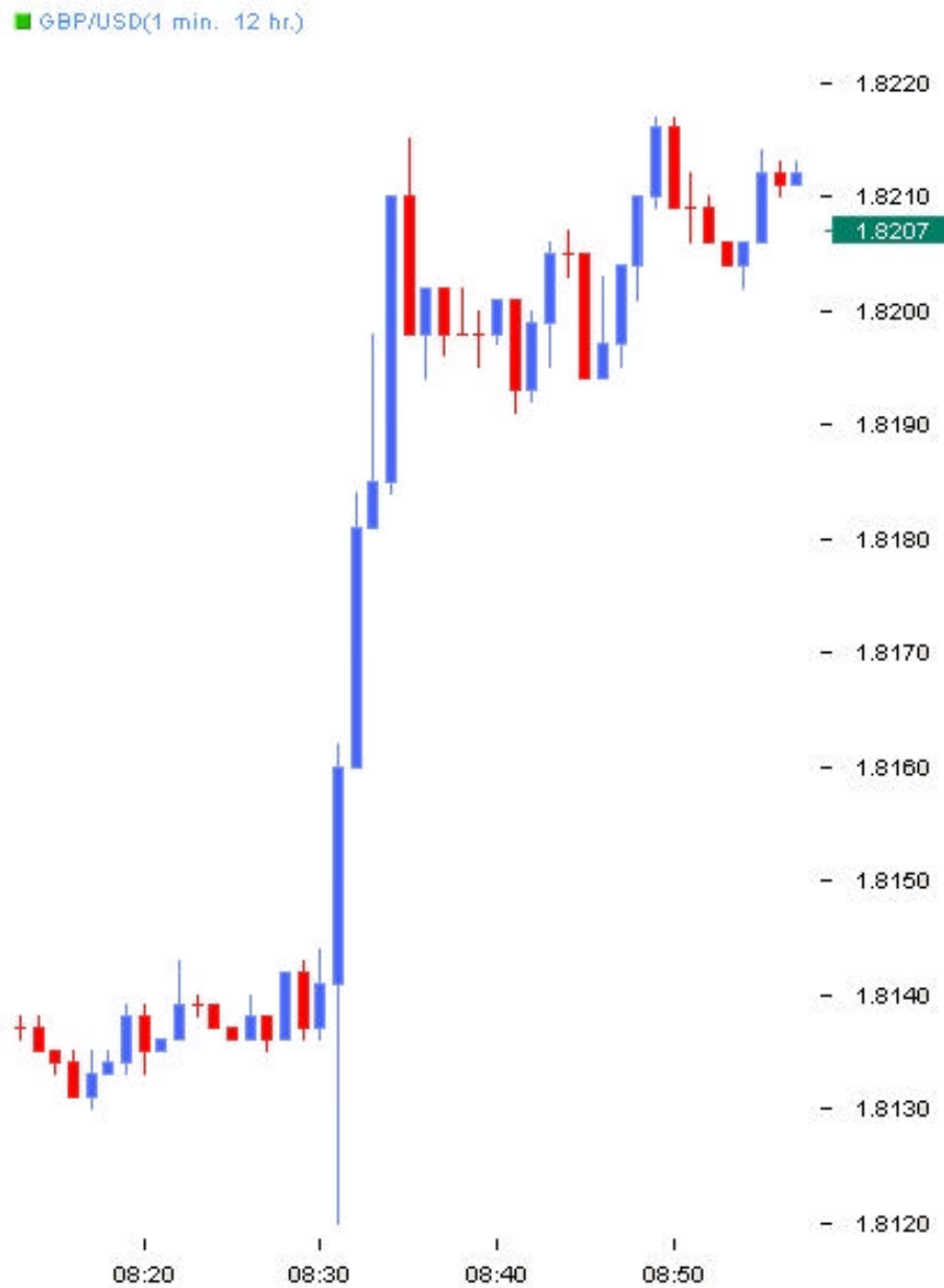
CHART 3 GBP/USD June 15, 2004 – 1 minute candles (time is EST)