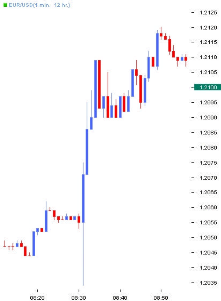
CHART 2 EUR/USD June 15, 2004 – 1 minute candles (time is EST)