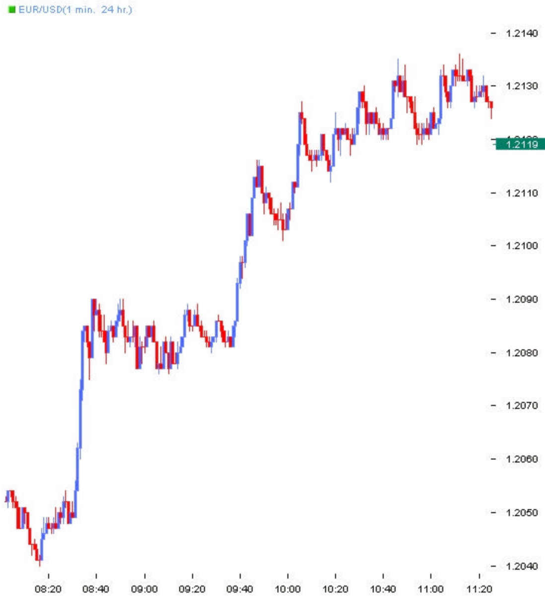
CHART 4 EUR/USD June 18, 2004 – 1 minute candles (time is EST)