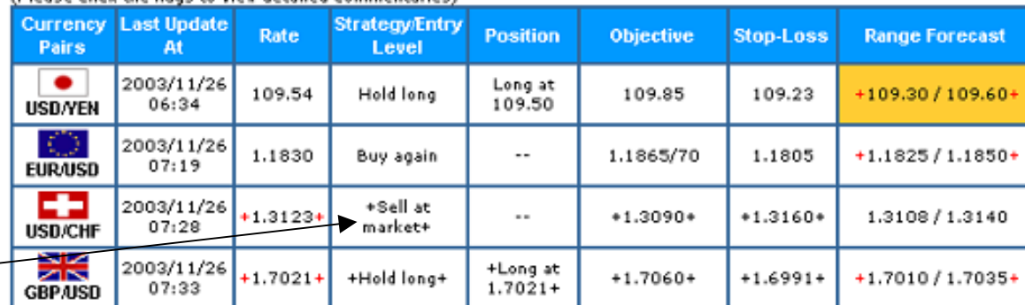
Daily Strategies Table:

(Please click the flags to view detailed commentaries)