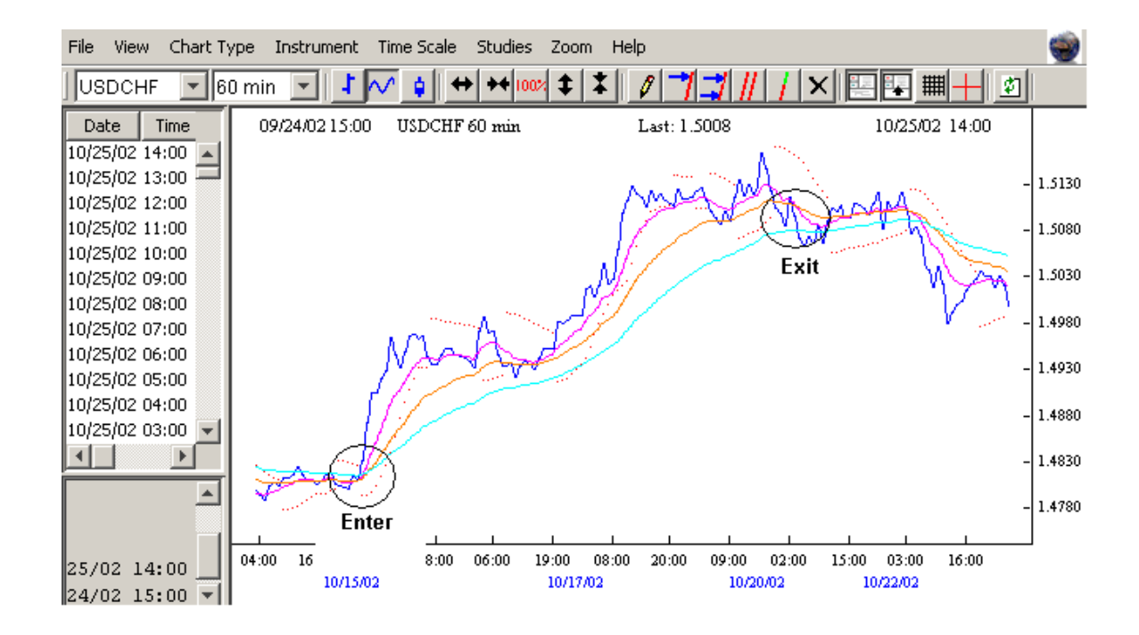
Step 2: When to Enter and Exit your Trades

This is what your chart should look like. These are the FPS indicators that I use to trade. The EMA 10 should be in pink, the EMA 25 should be in yellow, and the EMA 50 should be in blue. The Parabolic SAR is charted with dots above and below the line.