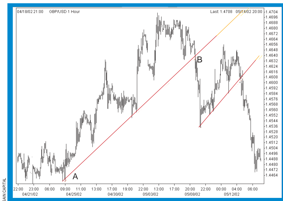
FIGURE 1: SIMPLE TRENDLINE. This hourly GDP chart shows an excellent opportunity to enter a short position on a trendline break of a previously strong upward trend.

Further, approximately 85% of all daily forex transactions involve “the majors,” which include the US dollar, yen, euro, British pound, Swiss franc, Canadian dollar, and Australian dollar. The depth and concentration of the market in just seven currencies provides a statistically significant dataset for trend analysis.