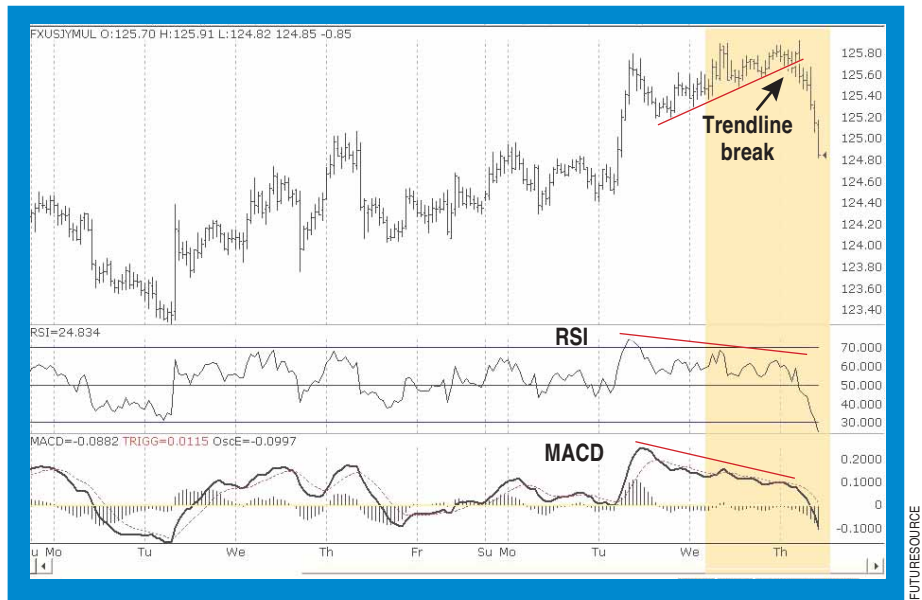
FIGURE 3: USING MULTIPLE INDICATORS FOR REVERSALS. When you see the diverging action of the RSI and MACD indicators, wait for the confirmation with the trendline break to enter a short position.

Since most currency trading is short-term in nature, speculators can cause erratic fluctuations in the exchange rates. You can see this in the 15-minute chart of the June 2002 Canadian dollar contract displayed in Figure 4. On June 3, 2002, due to the dismissal of the Canadian finance minister Paul Martin, short-term traders brought the value of the Canadian dollar down away from its long-run equilibrium point. But the value cannot move away from this point forever, and this can be seen by the quick revival of the exchange rate.