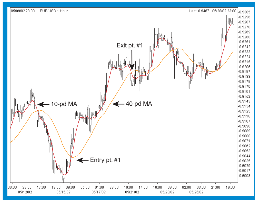
FIGURE 2: MOVING AVERAGE CROSSOVER SYSTEM. When the shorter-period moving average crosses above the longer-period moving average, consider it a signal to enter a long position. When the short-period MA crosses below the longer one, consider it to be an exit point.

These examples show the use of one indicator or technical analysis tool to make trading decisions. Often, you may have to use more than one. The chart of the euro in Figure 3 displays the use of multiple technical indicators as confirming signals. There, you see a divergence between price movement and the movement of the relative